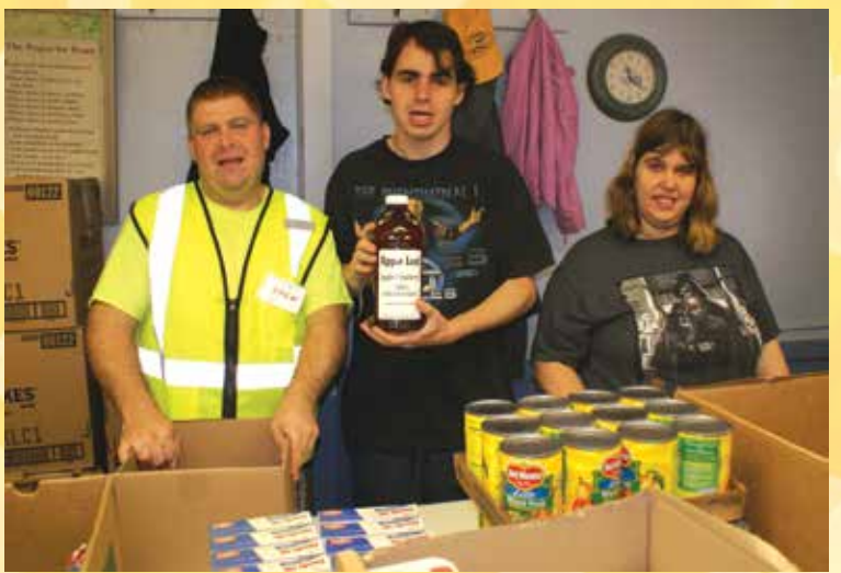
Adults help prepare nearly 200 food baskets every week at the St. Patrick's Food Pantry.

The Church of the Covenant is one of several sites where adults in Club Erie regularly volunteer, preparing the weekly dinner that is attended by many college students and recent immigrants who live in its downtown neighborhood.