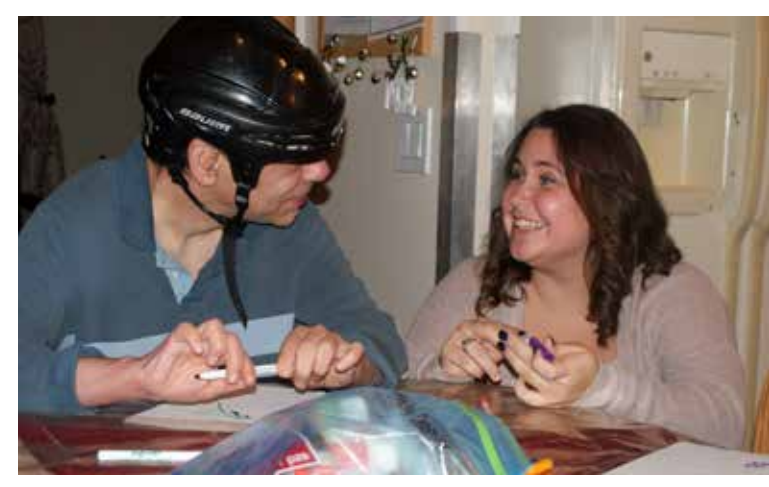
New computer infrastructure project will benefit adults living in Erie County group homes.